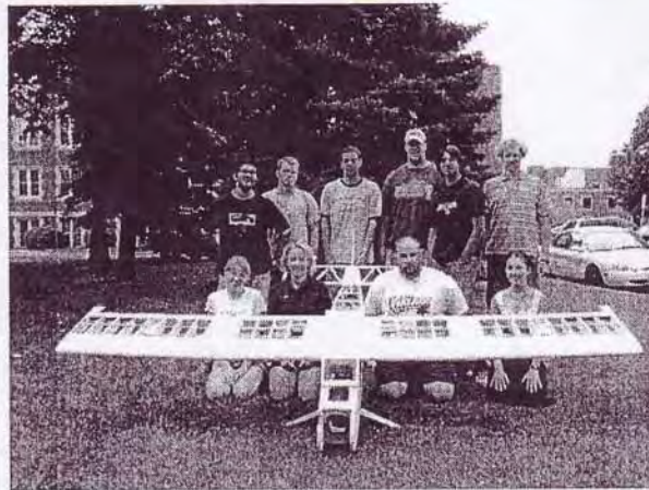
Upper Left: Albatross Unmanned Aerial Vehicle in flight (3-meter wingspan, capable of carrying payloads in excess of 4-kg). Upper Right: Albatross UAV with the BugHunter payload installed, used for controlled mosquito catching above the ground. Bottom: 2004 NSF REU Site participants next to the R/C airplane during its construction.